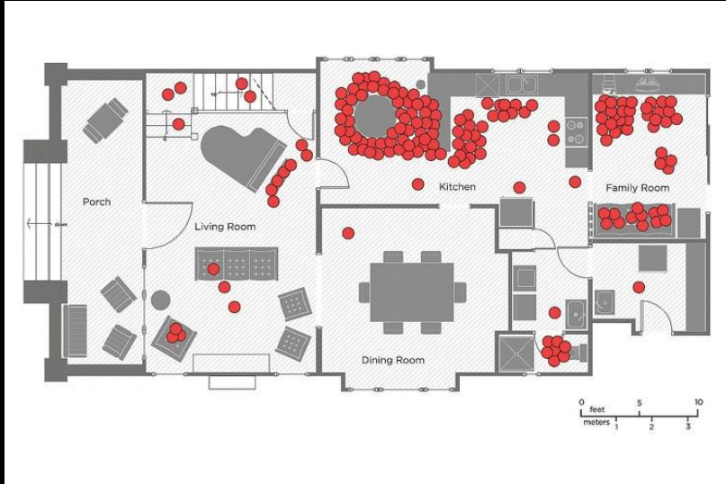
This image shows how much of a mansion is used over a few weeks. Each red dot symbolizes where someone used that space in each room.

The main problem with mansions is the unused space and materials. This space could have potentially been used to build more houses, used for farmland, or to even build an apartment. It is likely that many trees had to be cut down in order to make space for such a large home and then the materials used to build the mansion are not getting put to use. That lumber could have been used, for example, for another house. Instead it is being used for only a single family.